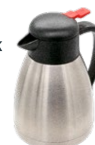
VACUUM FLASK S/STEEL VPS0010 - 1.2LT VPS0015 - 1.5LT VPS0020 - 2.0LT