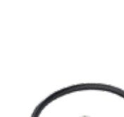
NIPON CTP0600 600ML