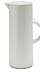
THERMO FLASK WHITE GLASS INNER TFW0001 1LT