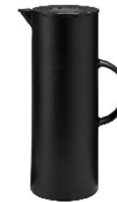
THERMO FLASK BLACK GLASS INNER TFB0001 1LT