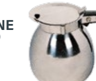
COFFEE DECANTER S/STEEL & LID CDA0020 2LT