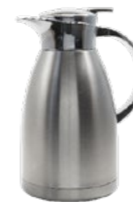
VACUUM FLASK S/STEEL INSULATED VPS0150 - 1.5LT VPS0200 - 2LT