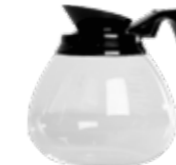
COFFEE MACHINE JUG GLASS - NO LID CMJ0001 1.8LT