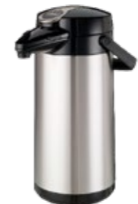
VACUUM AIRPOT ABB0022 2.2LT