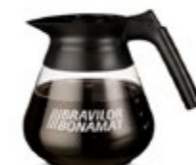
COFFEE MACHINE JUG GLASS WITH LID CMJ0002 1.7LT