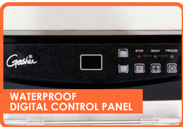
WATERPROOF DIGITAL CONTROL PANEL